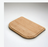
AC15 Bamboo Board