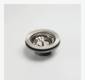
AC14 Basket Waste